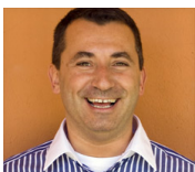
Juanjo G. Piñol

VINIFICATION AND AGING: Hand harvested in the cool morning hours, the grapes are brought to the winery in small, 15 kg boxes. After de-stemming, the grapes are crushed and go into 10,000-liter stainless steel tanks. The unfermented juice mixes with the skins at cool temperature (4C or 39F) for about 8 hours to maximize the extraction of flavors from the skins. The grapes ferment with neutral yeast (from Levuline in Champagne), which is optimal to ferment grapes with high sugar levels. The wine is aged in stainless steel tanks on the lees for two months. No malolactic.